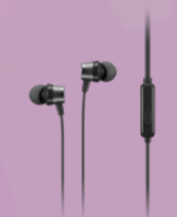
Lenovo Analog In-Ear Headphones Gen II Bulk Package (20pcs) 4XD1T54899

Please click here to view the full list of accessories.