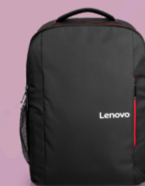
Lenovo 15.6 Laptop Everyday Backpack B510-ROW 4X41U80414

Please click here to view the full list of accessories.