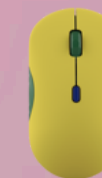
Lenovo 350 Bluetooth Silent Mouse (Fan Edition - Brazil) GY51U71760