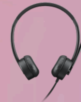
Lenovo Essential Stereo Analog Headset 4XD0K25030